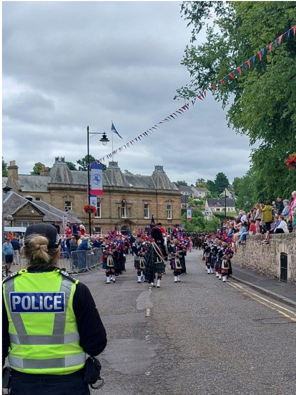
Jedburgh Festival Day, as the Callant returns to Abbey Place

Jedburgh Callants Festival went very well, with a number of very well organised community events and a great atmosphere in the town throughout. Officers always enjoy working these events which gives a great opportunity to engage with members of the community.